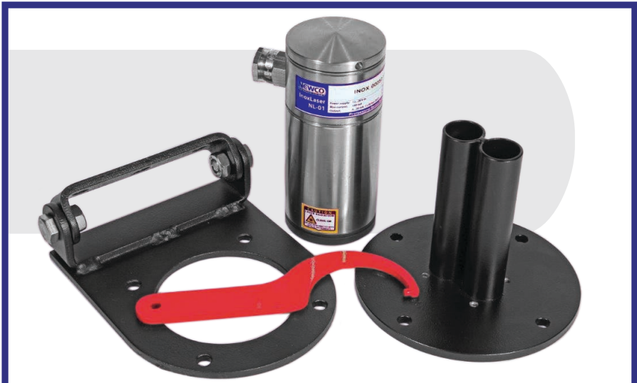
Level, distance & position measurement of solids